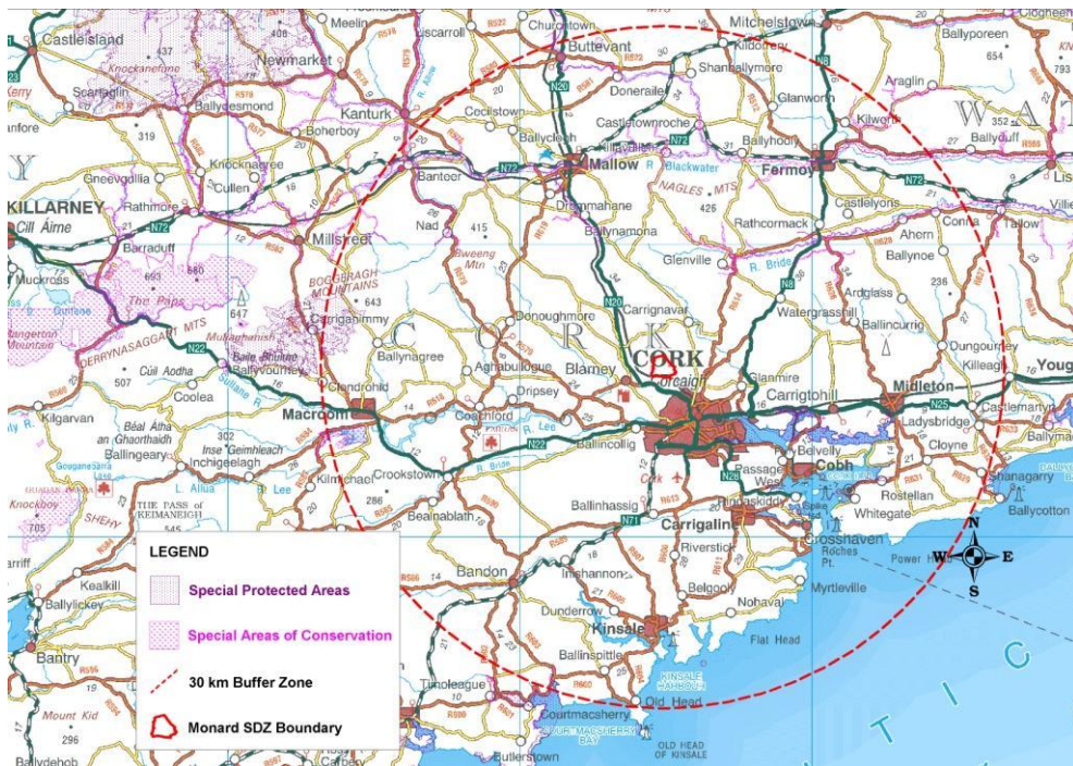
Figure 3: Special Areas of Conservation and Special Protection Areas within the potential impact zone of the Monard SDZ.