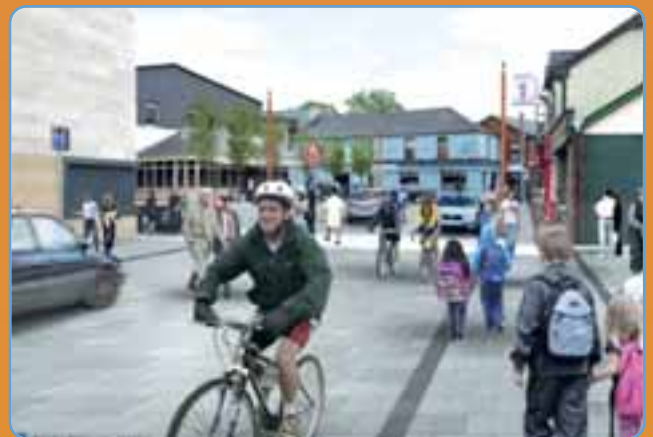
Some transport proposals of the future of Douglas