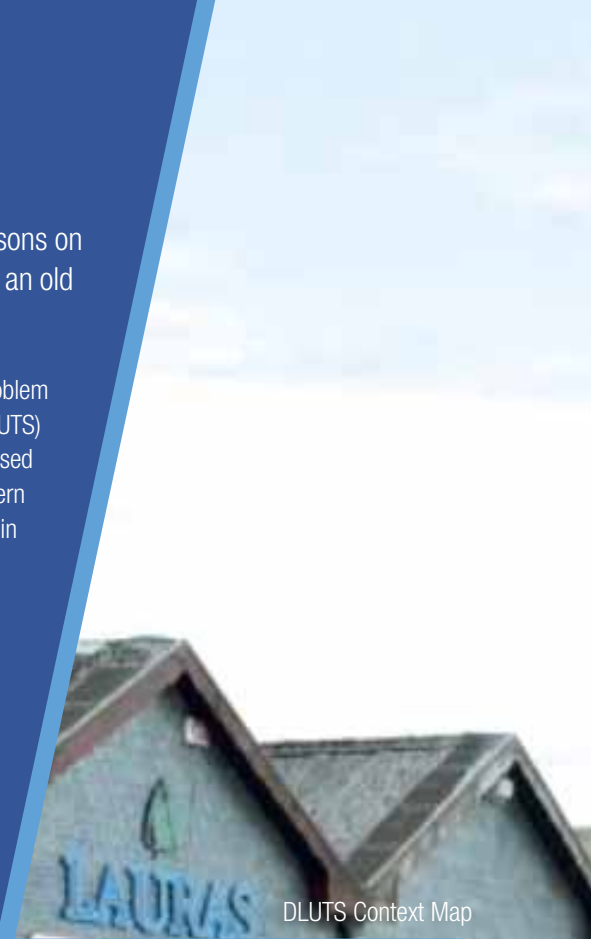
DLUTS Context Map

The project was undertaken by the staff of Forward Planning and Strategic Development in Cork County Council in conjunction with MVA Consultancy, who were retained to provide traffic and transportation inputs. It began in April 2012 and was completed by July 2013.