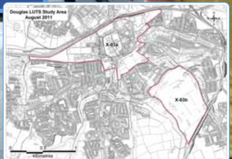
DLUTS Study Area